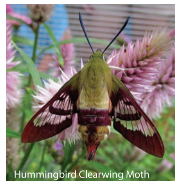
Hummingbird Clearwing Moth