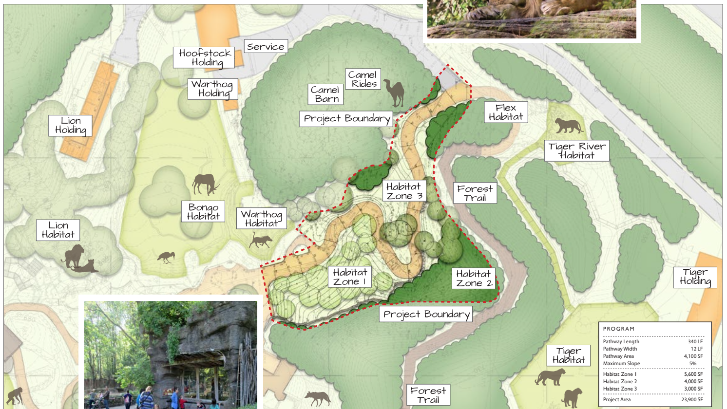
SITE LAYOUT AND GRADING PLAN